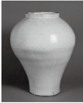
Jar, white porcelain, Joseon period, 54.1 × 44.3 cm

Soetsu Yanagi (1889-1961), founder of the Museum, paid attention to the crafts of Joseon period in Korean Peninsula from the very beginning, and accomplished a splendid collection through his consistent aesthetic eyes. Then he published many articles regarding Joseon crafts inspired by their beauty, organized exhibitions, and had widely informed the attractiveness of Joseon crafts for his life. This exhibition showcases mainly ceramics, also paintings, wood works, stone works, and metal works from the Museum collection, and you will enjoy the beauty which reflect their own spirituality.